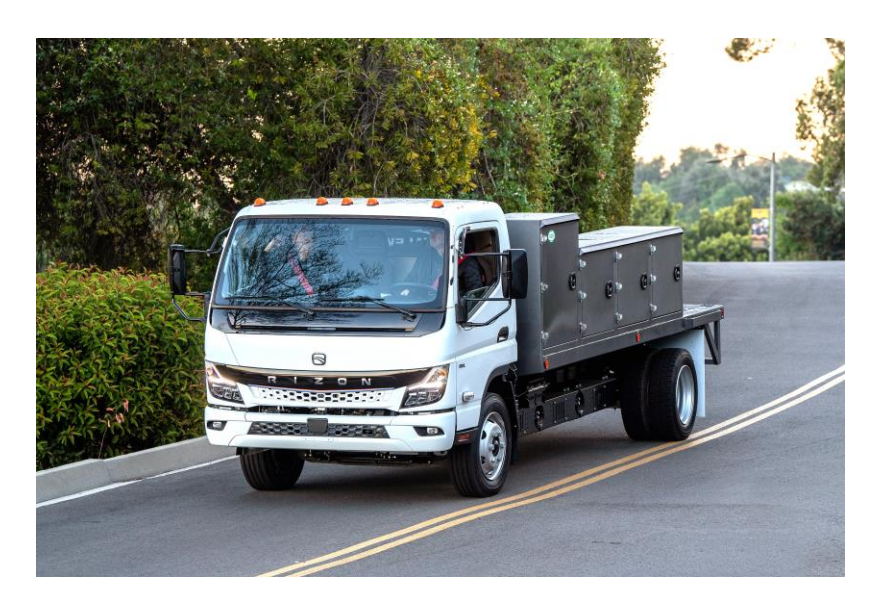
Photo Caption: Velocity EV, one of the Daimler Truck Group's largest North American dealer partners and the exclusive U.S. distributor of the medium-duty, battery-electric RIZON truck brand, expanded its network of RIZON certified dealers that includes 24 locations across seven states.

RIZON is a commercial electric truck brand <u>introduced in May 2023</u> from Daimler Truck Group, one of the world's largest commercial vehicle manufacturers. Velocity EV delivered <u>the first trucks to California customers this year</u>, deploying the fleet throughout its dealer network for immediate purchase and body customization. For additional information and to explore the RIZON truck models, please visit www.rizontruck.com.